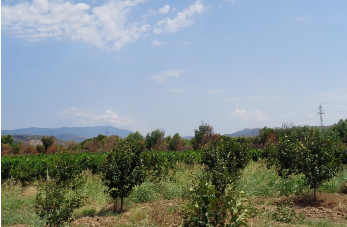
- existing towers no. 12-13, direction towards Miletkovo

Existing 110 kV OHL from Vlandovo to Miletkovo (arable land uses in vicinity to the line)