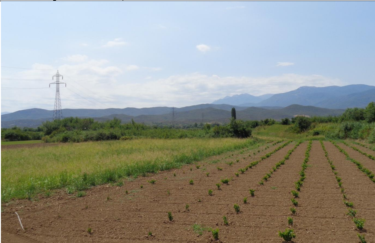
- existing towers no. 15-16, direction towards Miletkovo