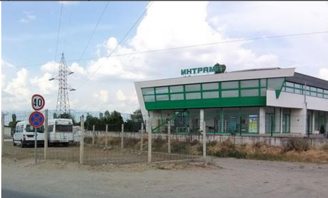
- Commercial property in immediate vicinity to the line, within the OHL safety corridor