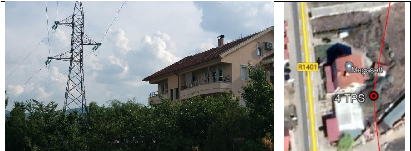
- Residential and commercial property in immediate vicinity to the line, within the OHL safety corridor