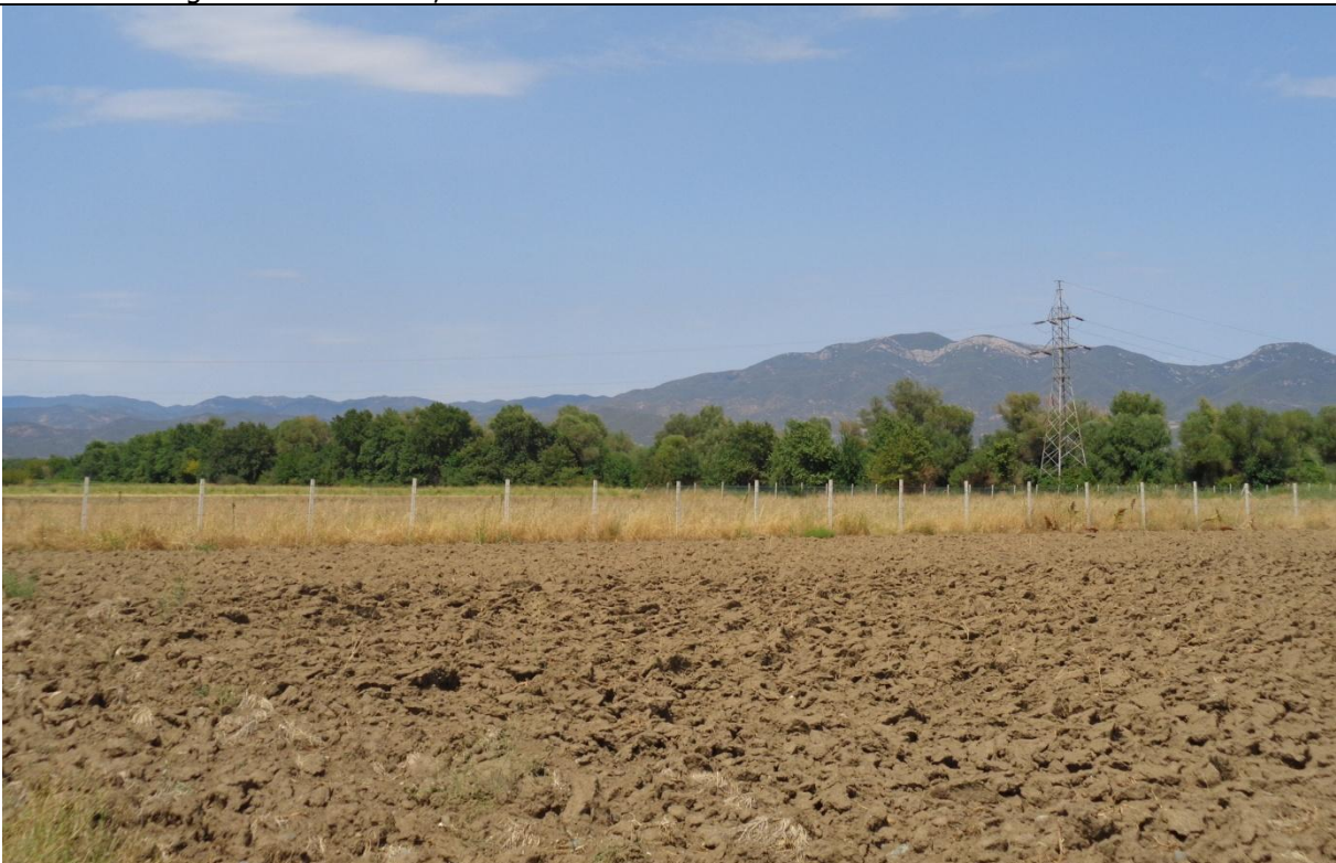
- existing tower no. 20, at vicinity to SS 'EVP' Miletkovo