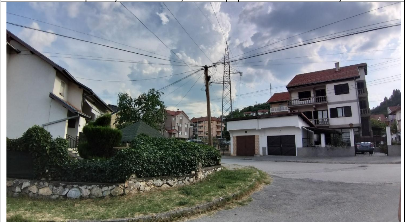
- In immediate proximity to SS Strumica 2, residential properties within the OHL safety corridor