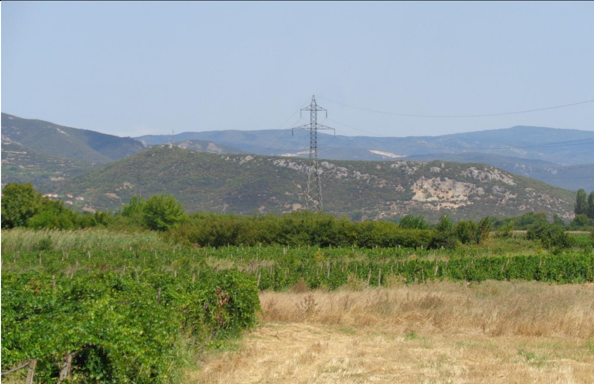
- existing towers no. 12-13, direction towards Valandovo