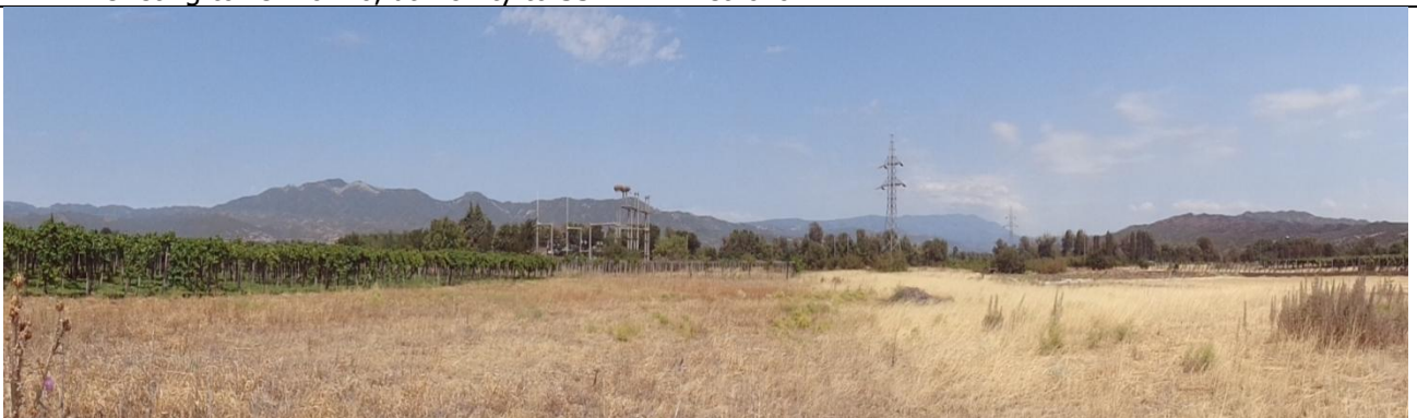
- view to SS 'EVP' Miletkovo