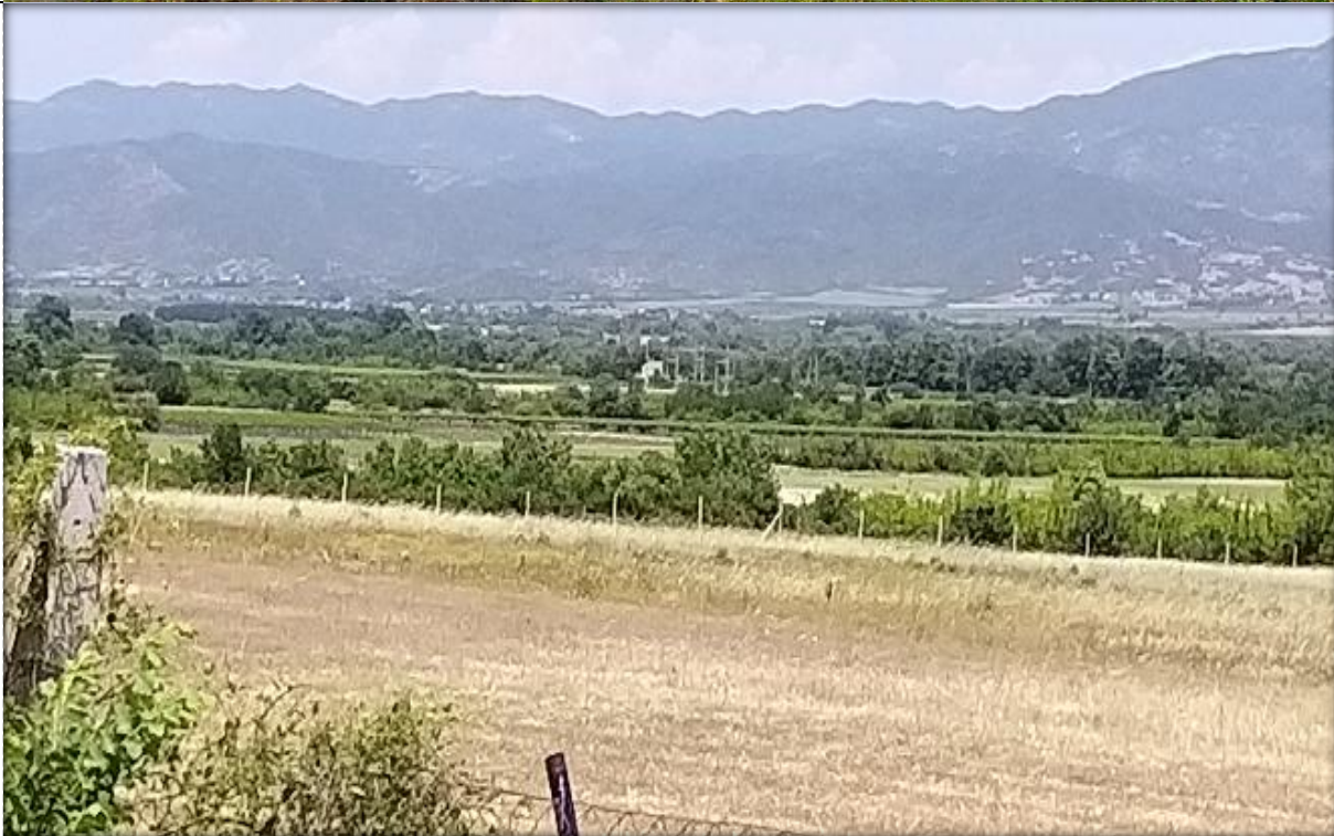
- view towards existing SS 'EVP' Miletkovo