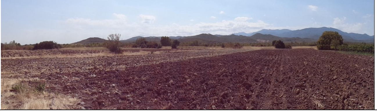
- view towards new 400/110 kV substation