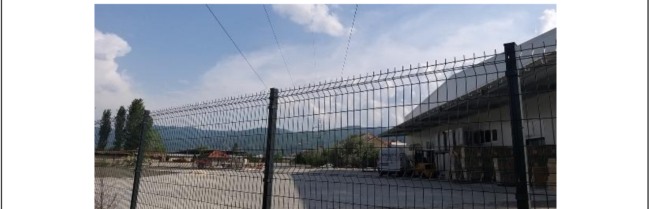
- Commercial properties, within the OHL safety corridor, in immediate proximity to SS Strumica 1