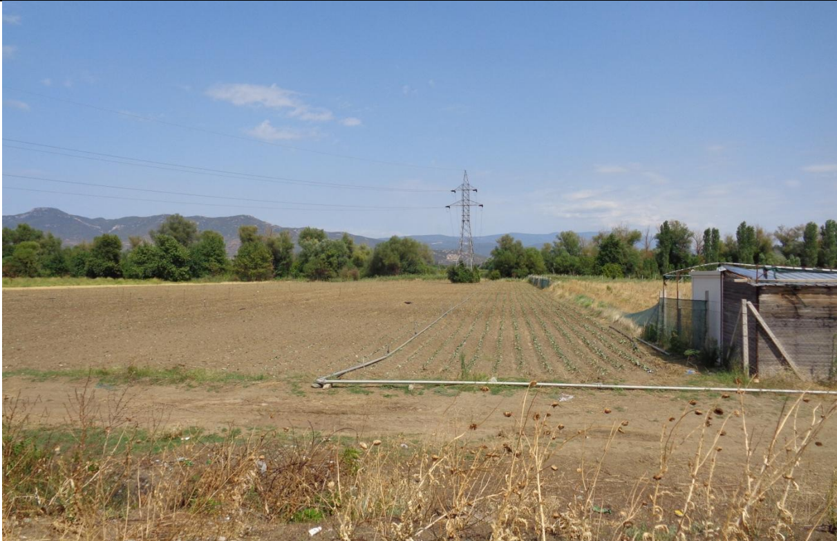
- existing tower no. 20, at vicinity to SS 'EVP' Miletkovo