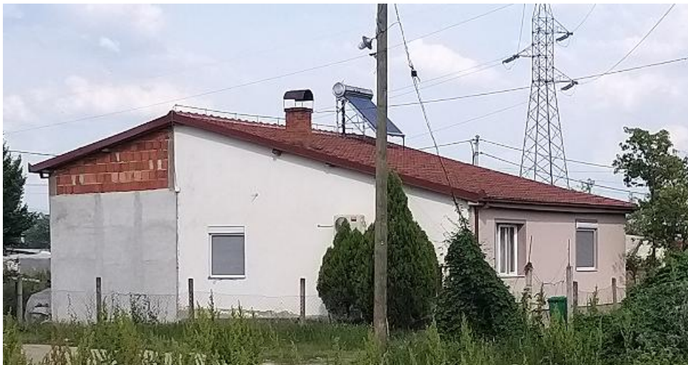
- Residential property below the line