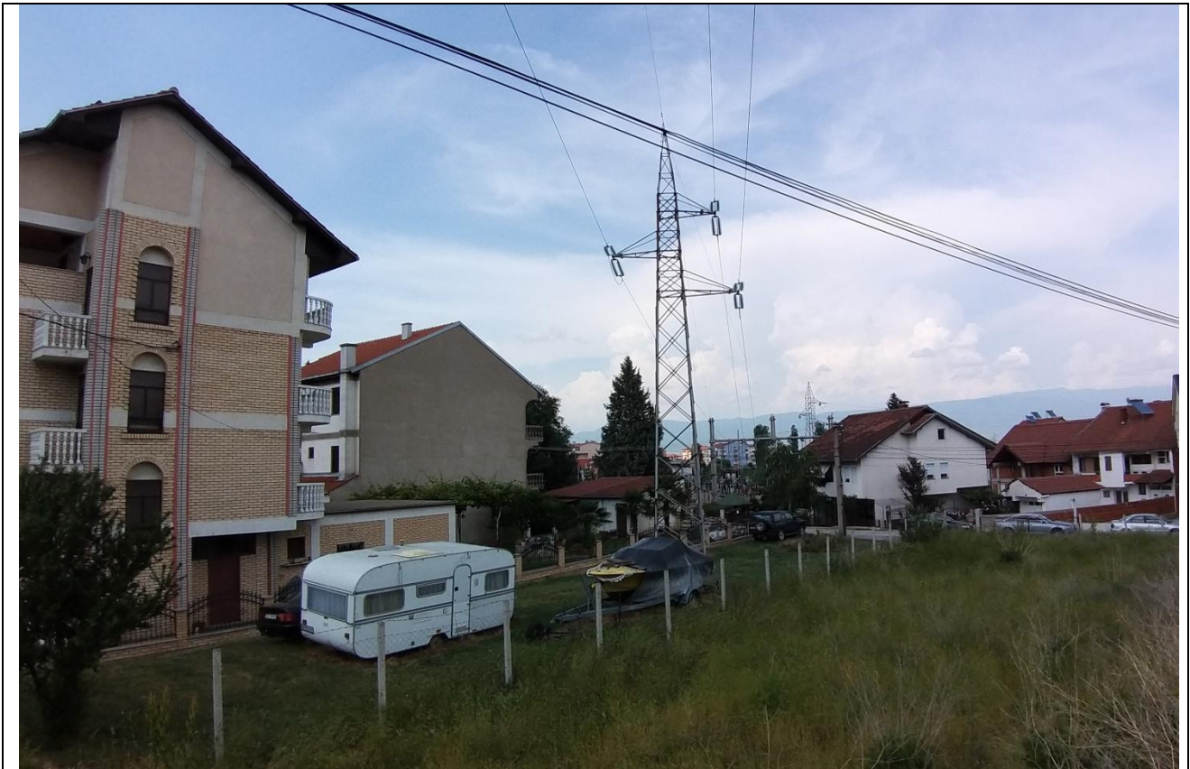
- In immediate proximity to SS Strumica 2, residential properties within the OHL safety corridor