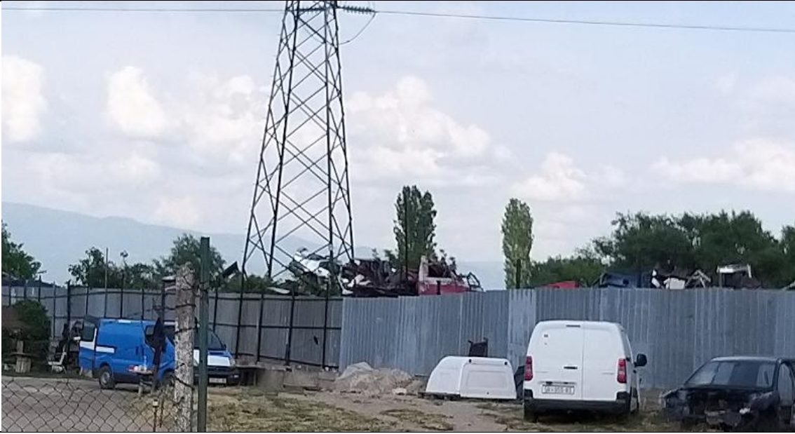
- Commercial properties (waste collection and treatment facility) below and immediate vicinity to the line, within the OHL safety corridor