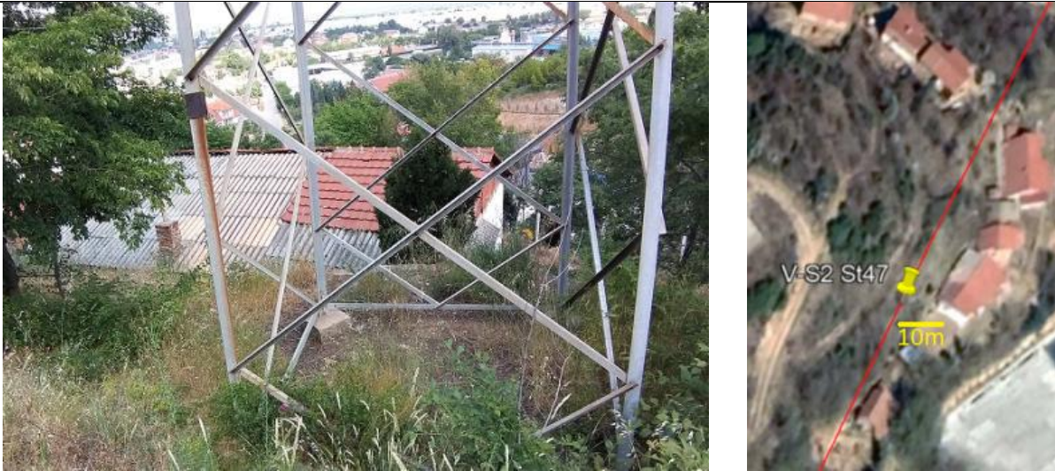
- OHL entrance to urban zone of Strumica